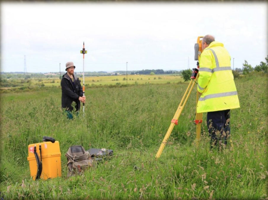
Total Station survey