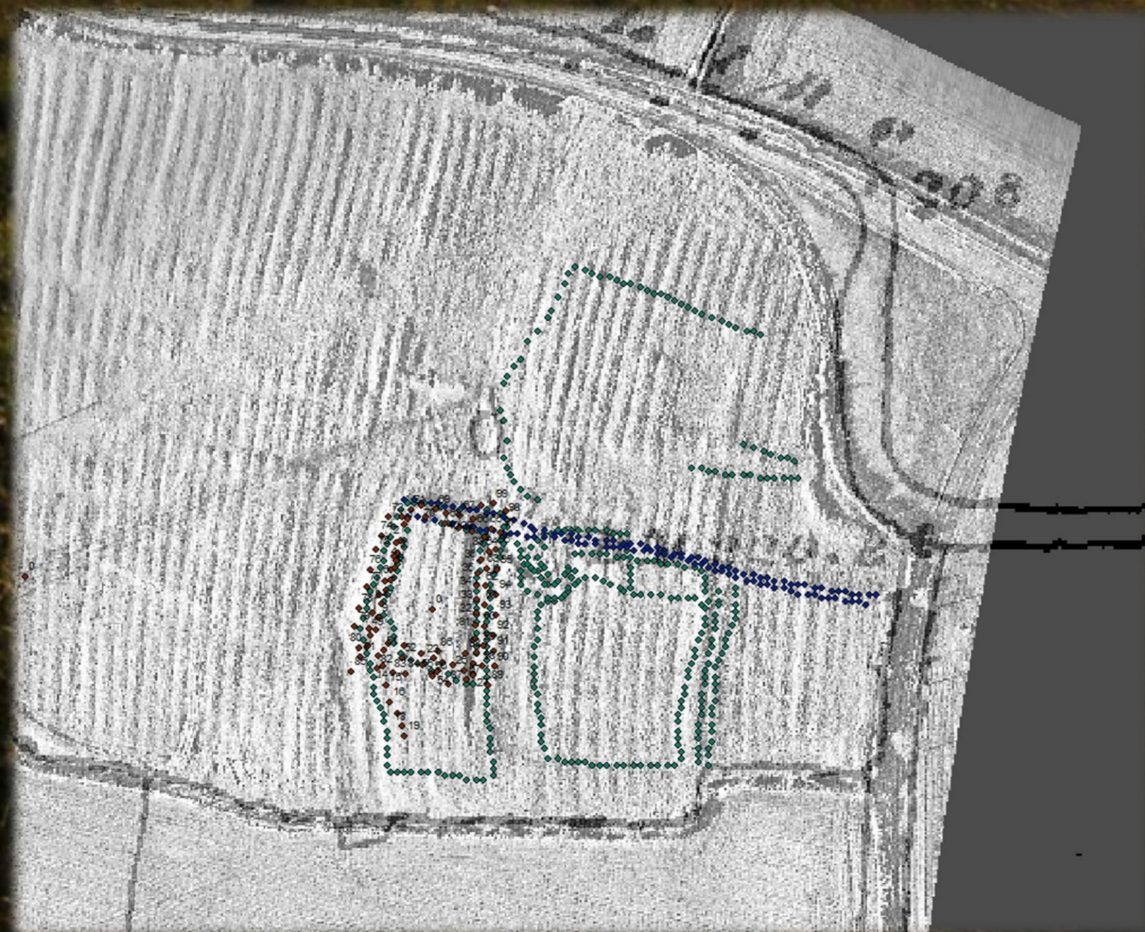
Preliminary results incorporated into GIS